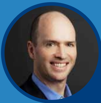
Ben Horowitz CEO and investor with vision

The world of tomorrow and we show you the way.