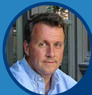
Paul Graham A simple idea becomes to global success

book, Airbnb, Twitter and Pinterest. Previously, he had created the first and, around the turn of the millennium, he was co-founder of the IT company Loudcloud, the pioneer in Cloud-Computing.