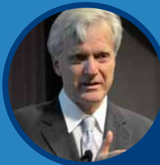
Andreas from Bechtolsheim Google early investor

It starts with a simple idea that turns students and young entrepreneurs into start-up gurus and investors of the first generation hour to become billionaires. Business leaders from all over the world travel to the Valley to learn the secret formula for success to decipher. To be accepted in the circle of the tech elite and visionaries, you have to be early and Act with foresight.